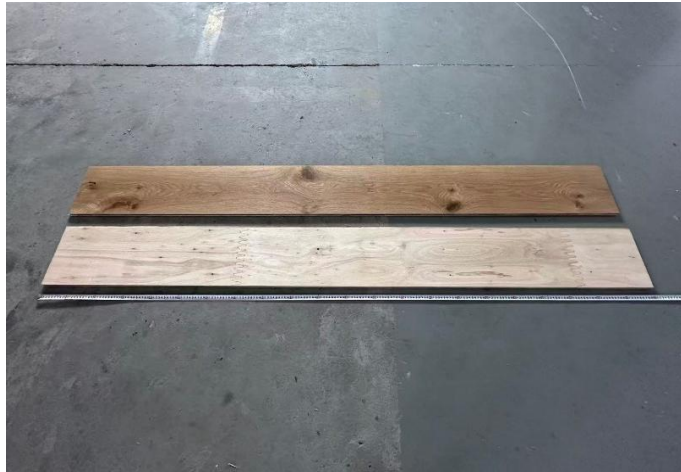
Front view & Back view