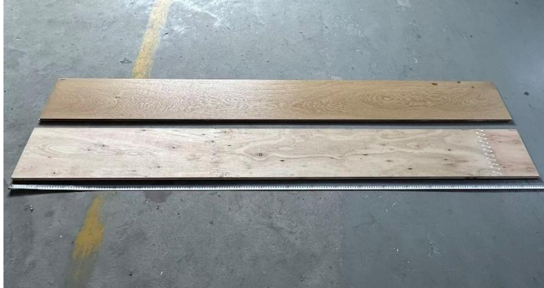
Front view & Back view