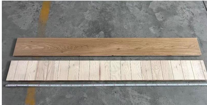
Front view & Back view