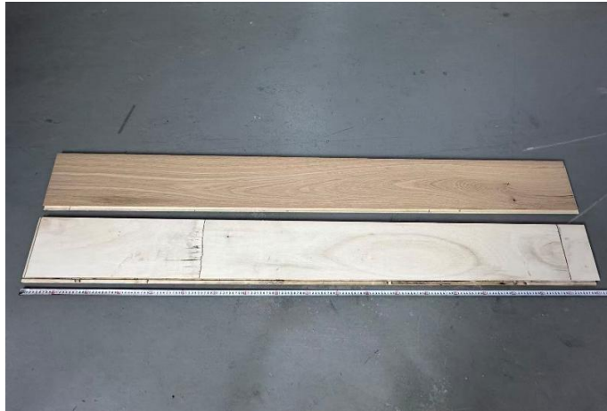
Front view & Back view