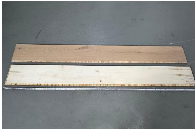
Front view & Back view